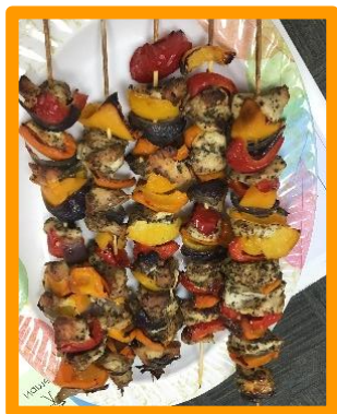
LS and SF fully engaged and participated in their classroom cooking activities.