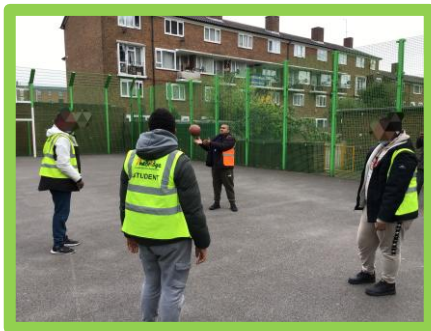
Classroom 2 engaged in a group activity at the park