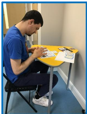
PHOTO SPEAK ON ACTIVITIES DONE BY OUR LEARNERS